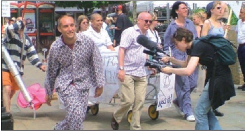
ENGLAND: For the second year, psychiatric survivors and allies celebrated Mad Pride by conducting Bed Push 2006. They started in Brighton, UK, and in pajamas pushed a bed with a mannequin tied down to it in "restraints" for 50 miles over five days. This creative approach gains widespread media attention. The Bed Push 2005 (left) was even featured in a documentary shown on UK television. The Mad Pride Bed Push 2006 ended up at the ex-site of the infamous Bedlam psychiatric institution where they held a "Mad Hatters' Tea Party."